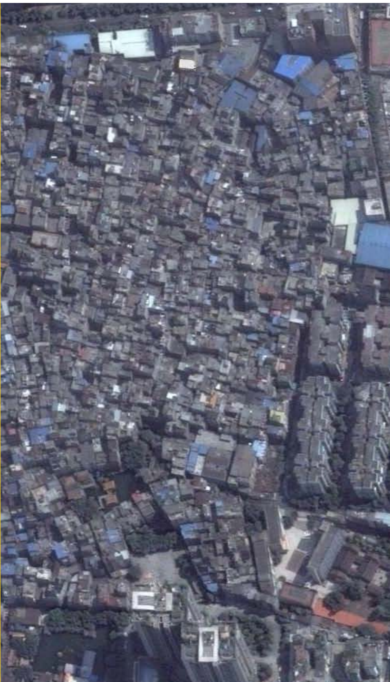
Urban-Village, Guangzhou, China

BAS, Bergen School of Architecture, Sandviksboder 59-61a, 5034 Bergen, Norway, ww.bergenarkitektiskole.no, Phone +47 55 36 38 80